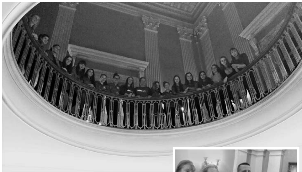
Pictured above is the Girls Varsity Swim team in the Niagara County Court House